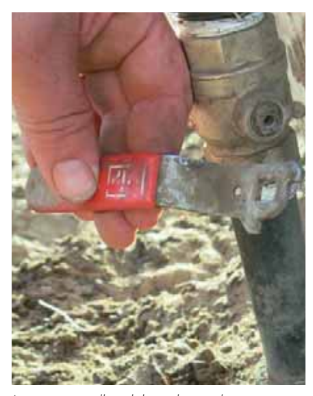
It pays to install a globe valve on the water supply to the trough so the valve can be easily serviced, or the trough can be turned off. Note the valve handle has been removed to prevent cattle accidentally shutting off the trough. The valve can be operated using fencing pliers, or by using the old handle as a spanner.

Generally speaking, sleeve valves are a little more vulnerable to blockage than flap valves, as the path through the valve is a little more convoluted. Units like the Cocky valve have a large orifice, allowing plenty of room to pass solids in the water. Solids tend to cause more problems with valves failing to fully shut, rather than blocking the flow.