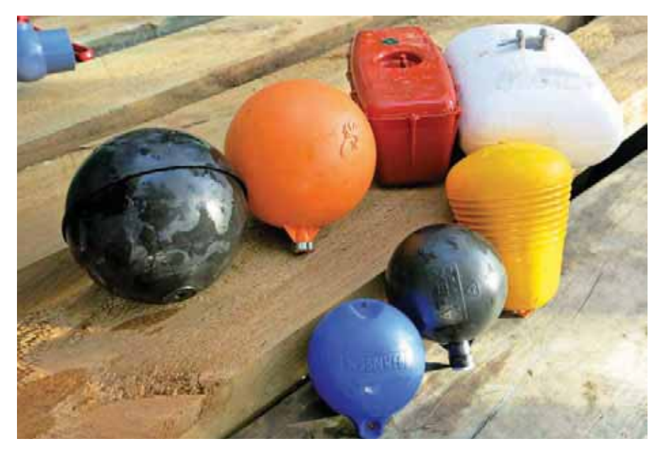
Floats are a pretty important, but often overlooked, part of the system. Make sure the threads are in good condition, and any locknuts on the float arm are tightened against the valve. Floats pictured (clockwise from left) are the Philmac 150mm, Cocky valve, Philmac Stockproof, Raindrop, Jobe, Hansen Max-flo and Apex Xtraflo.